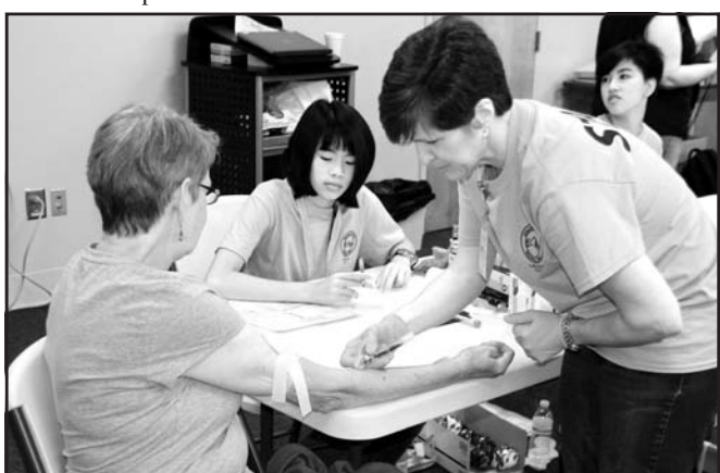
An image from the 2016 Health Fair at Union General Hospital.

Chatuge Regional Hospital in Towns County, which is part of Union General Hospital Inc., will be hosting a Health Fair of its own on May 13 in Hiawassee.